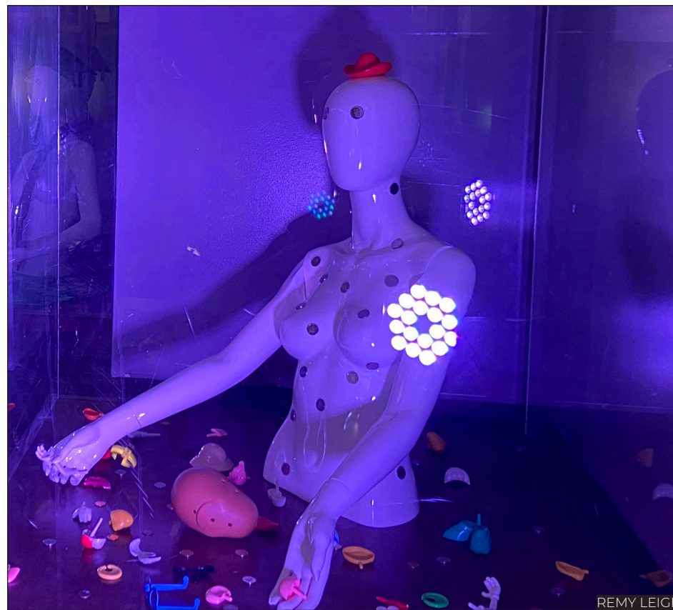
Display showing a mannequin surrounded by Mr Potato Head accessories with a sign stating: 'The chances of having been born male or female.'

EVERYBODY will be performed from Nov. 22–26 at the Modern Languages Theatre. Tickets are $10 for students and can be purchased at https://www.uweverybody.ca/