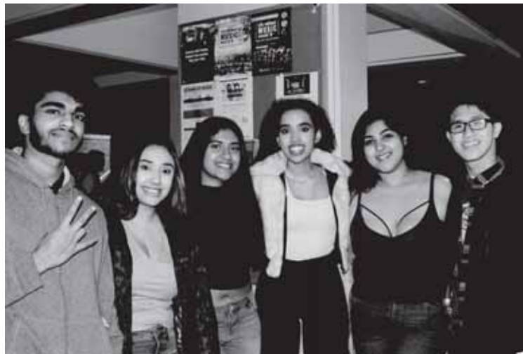
For many students, it was their first Bomber Wednesday.