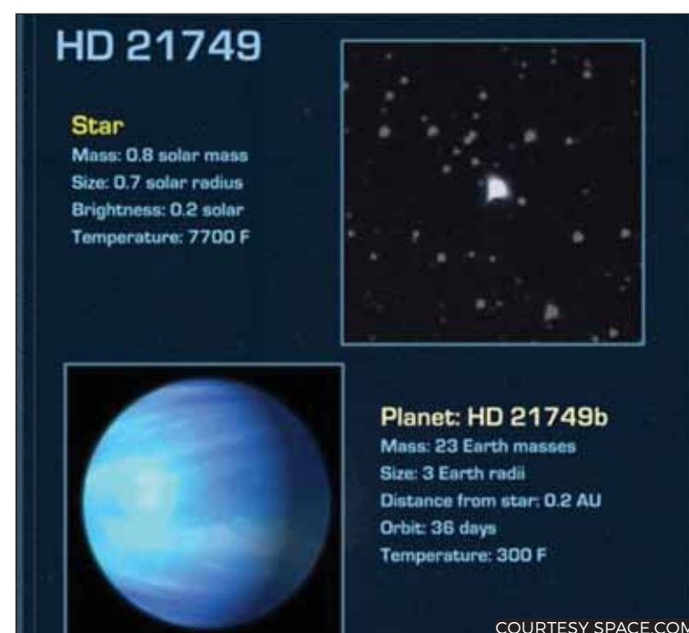
Planet HD 21749b is the third planet to be discovered by the TESS satellite.

One thing is certain though: each new planet that is uncovered will host new secrets to help our understanding of what is beyond our solar system.