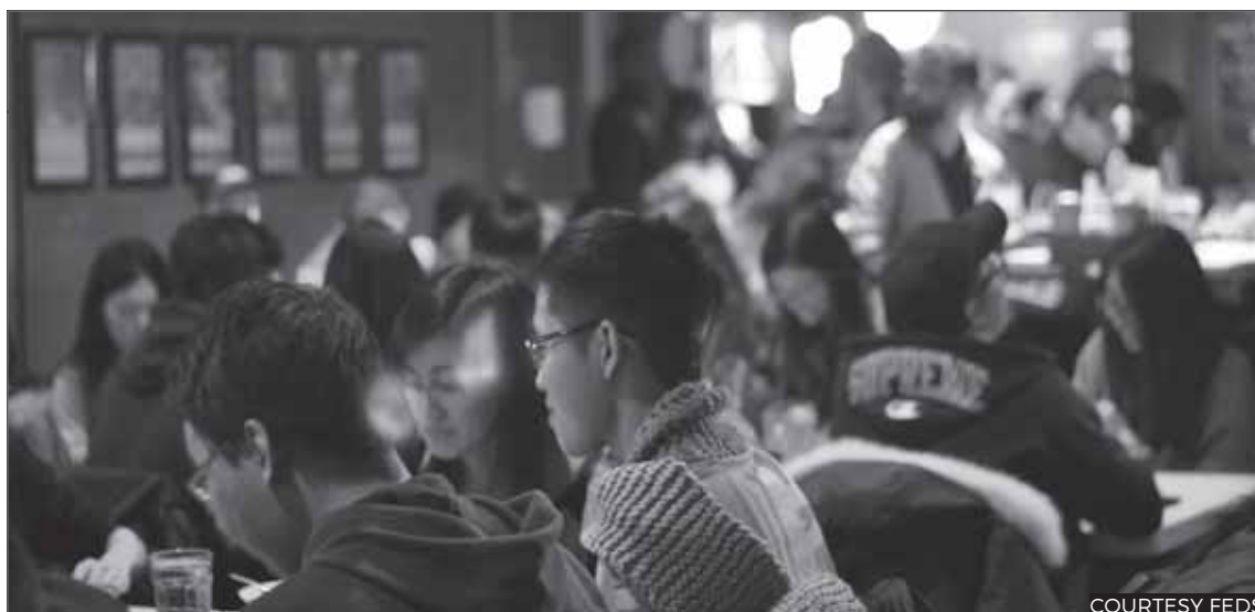
Many students were disappointed with the way that the termination of employment of the staff was handled.

The Board of Directors was involved in the process so as to approve the appropriation of funds for the renovation of The Bombshelter Pub. The Student Council was not a part of the process.