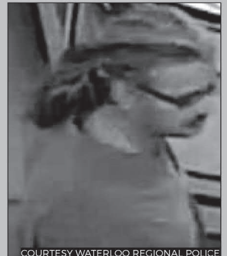
Waterloo Regional Police need the public's help to identify this man, who was reportedly following a young woman in Walmart.

Anyone with information is asked to call police at 519-570-9777 ext. 9777 or Crime Stoppers.