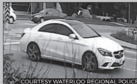
Waterloo Regional Police are searching for this four-door Mercedes after a murder in Kitchener.

The suspect vehicle was last seen near Highway 401 in the Erin Mills area.