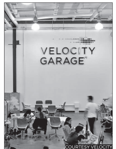
Velocity Garage at Waterloo.