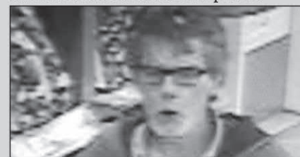
Police are searching for this man.

tall, with a thin build and grey and brown hair. He was wearing black-rimmed glasses and a grey hoodie. Anyone with information is asked to call police.