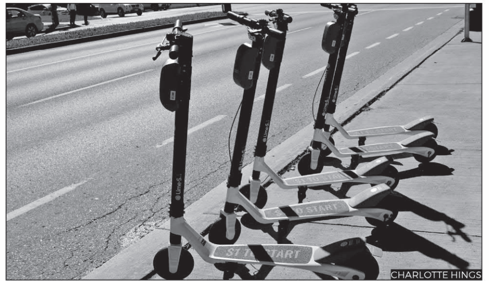
Lime e-scooter waiting for riders at Columbia and Hagey Blvd. bus stop.

He also laid out the statistics for usage of the product so far: typically, on a successful day, bikes see one to two rides on average,